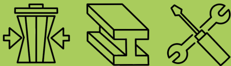
Reducing Waste & Pollution

We have a board of directors to better ensure compliance and checks and balances. Additional company investments have been made such as in-house human resources and legal support to safeguard the trust for our company and customers.